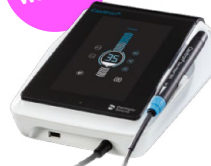
Cavitron® 300 #8161429