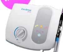
Cavitron® Plus #8161425