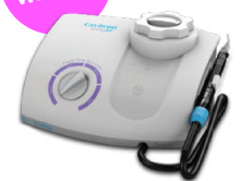
Cavitron® Prophy-Jet #8161427