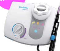
Cavitron® Jet Plus #8161428